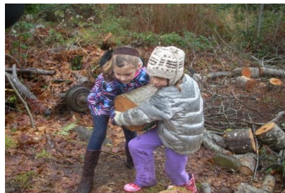
Our lovely and strong Phoenix girls